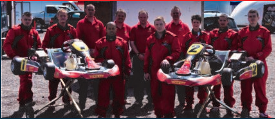
British Army Karting Team 2012